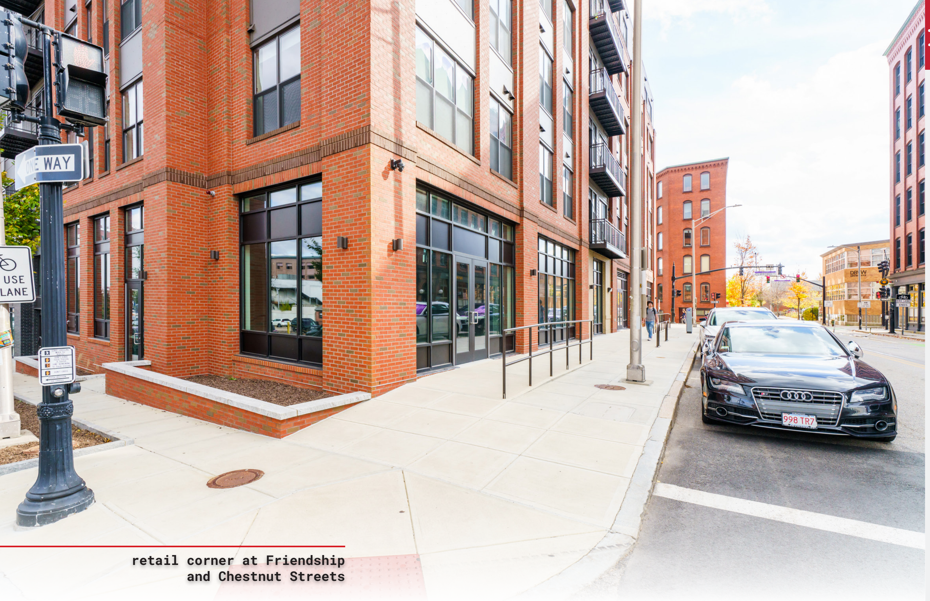
retail corner at Friendship and Chestnut Streets