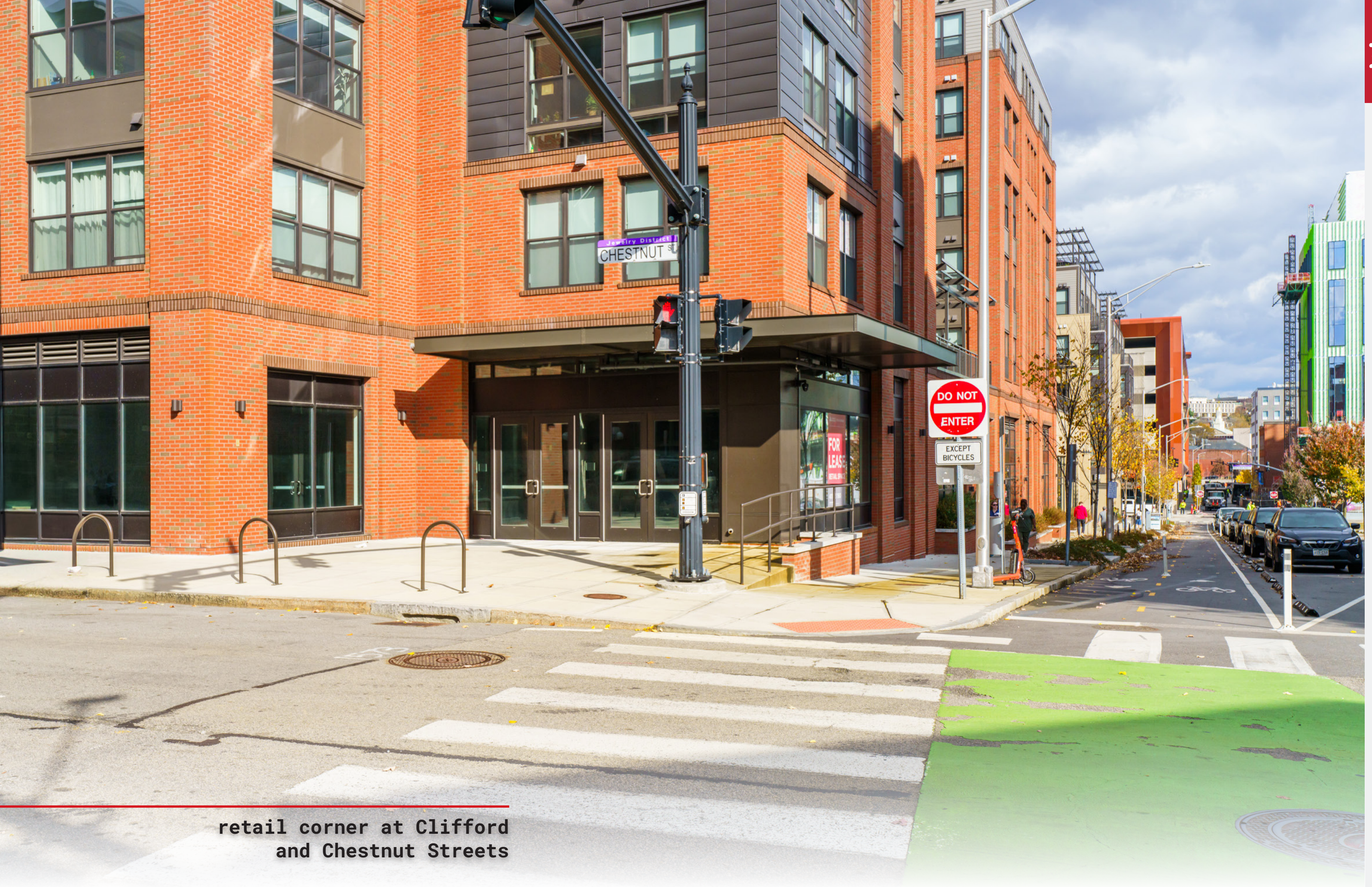
retail corner at Clifford and Chestnut Streets